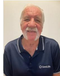
Glen Hall Villa 15

At the end of the day, we should embrace what we have and enjoy the fact we really do live in Paradise.